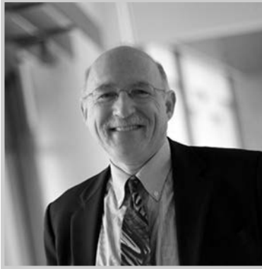
Barry Posen is Ford International Professor of Political Science at MIT and director of the MIT Security Studies.

The grand strategy of restraint was first conceptualized in the mid-1990s, the early years of the post-Cold War world. This was the “unipolar moment” when the United States was indeed the most capable state in international politics by a wide margin. Restraint advocates saw the momentum building for an activist U.S. foreign and security policy and argued that such a policy was unnecessary and unprofitable. It was, however, possible. The policy was driven forward by overwhelming American power. There was simply nothing to stop the United States. But this was not the only cause. Liberalism was victorious in the Cold War, so the United States, along with its democratic allies, succumbed to a kind of triumphalism. Democracy and free markets would be the order of the day, and U.S. power would protect and nurture this long expected evolution. George Herbert Walker Bush coined the phrase “new world order,” which sounds incongruous coming from a Cold War realist and spymaster.