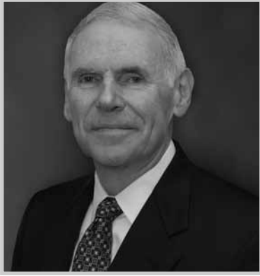
The panel was moderated by Adm. William Fallon (pictured above), a CIS scholar and the former head of CENTCOM.

H ow do we balance national security and privacy in an age when the government can access virtually all of our electronic communications?