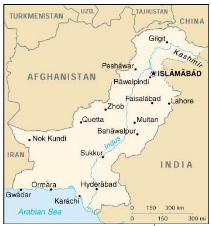
Figure 1: Map of Pakistan<sup>4</sup>