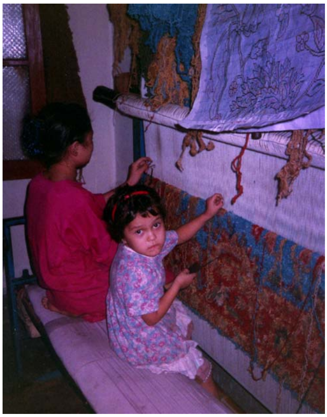
Figure 3: Four-year old Hazara girl and an older sister weaving a carpet at home

The most pressing concern related to GoP policies regarding the carpet industry is their impact on the welfare of refugee children. The most time-consuming and arduous component of carpet making is weaving. The small hands of children, their dexterity, and the speed at which they work compel Hazara families to recruit their own children into the industry. As a result, many children forego primary school to work an average of twelve hours a day to support their families. Children enter the carpet industry as weavers as early as four years old (See Figure 1). At age sixteen, males are encouraged to continue in the industry as dyers or pattern makers, while females of the same age typically manage younger siblings in carpet weaving. It is unclear how the GoP proposes to shed the image of carpet towns as incubators of child labor. A manager of the Chamkani Carpet Town noted that schools would be built inside the carpet towns for children. Nevertheless, it remains difficult to fathom how the time of weavers will be apportioned between carpet making and school. Further research needs to be conducted regarding the fate of Peshawar's carpet towns. This is especially important given the pace of Afghan repatriation.